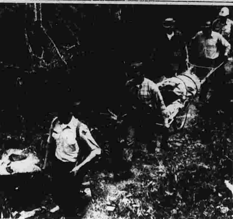
Moving Day for a Bear

Both bears and people are welcome in the wild areas of this noted park—but not both at the same time or in the same place. Here an overly friendly bear is carried on a bicycle-wheel carrier to an area not as often frequented by visitors.